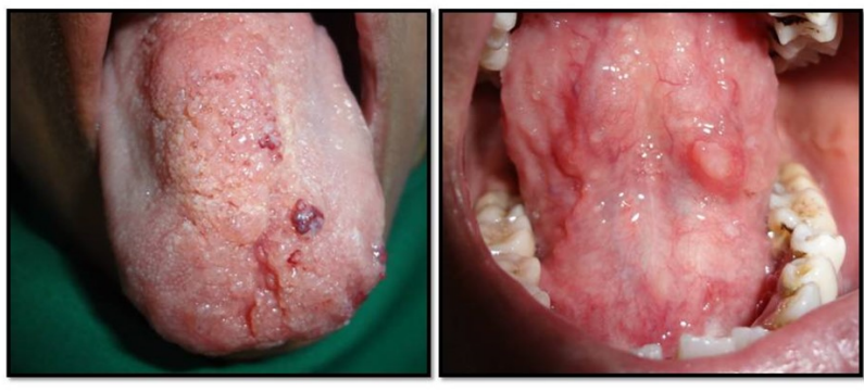
Figure – 1: Microcystic Lymphatic malformation involving the dorsal and ventral surface of the tongue.

The color of the lesions ranged from pale pink to purple. A linear fissure was seen in the centre of the anterior one third of the tongue (Figure – 1). Crenations were noted at the lateral borders and tip of the tongue, with no restrictions in the movement. On palpation, it was soft to firm in consistency, mildly tender with a pebbly surface and no discharge was elicited. Diascopy test performed on the lesion showed blanching, which suggested it to be of vascular origin. Based on the history and clinical examination a provisional diagnosis of Lymphatic malformation of tongue was made.