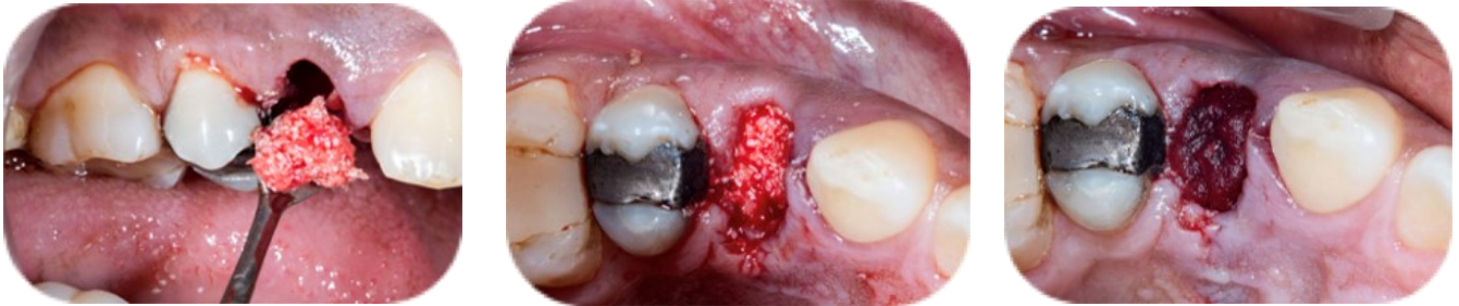
Figure 9: Alveolar Reconstruction: (a) Graft Placement; (b) positioned graft (Occlusal View); (c) Positioned Bonding Membrane