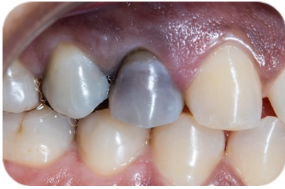
Figure 2: Initial Clinical Aspect (Vestibular View)