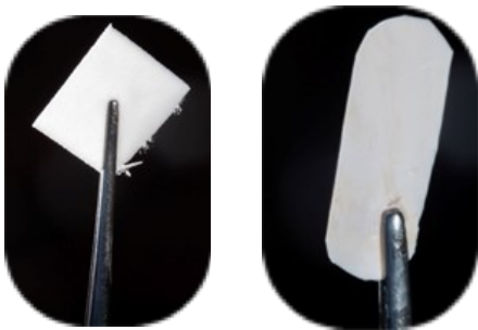
Figure 10: Non-Cross-Linked Bovine Type Bonding Fluoride