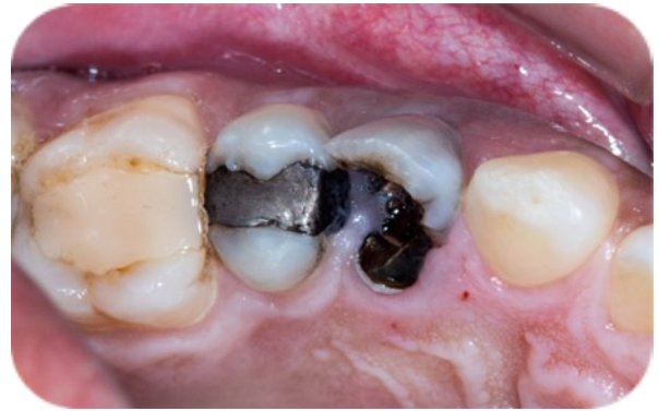
Figure 3: Initial Clinical Aspect (Occlusal View)

During the exam and clinical analysis, there was indication for removal of tooth 14, where was offer the removal of the dental element ( Figure 4 ) and immediate implantation, followed by reconstruction of the alveolus ridge with xenograft associated with particulated autologous graft ( Figure 9 ).