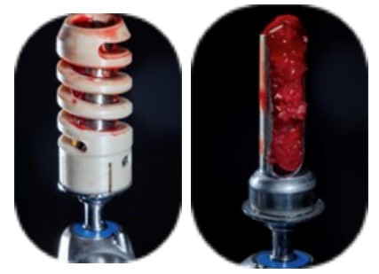
Figure 7: Trephine Collector (Bullet Collector) Cutter