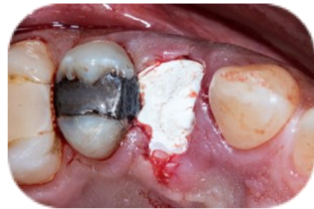
Figure 11: Positioned Polyethene Barrier – PTFE (Occlusal view)