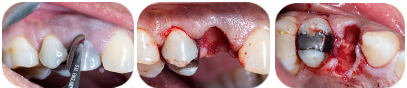
Figure 4: Atraumatic extraction process: (a) Intra sulcular incision; (b) Vestibular View After Atraumatic Extraction; (c) Occlusal View After Atraumatic Extraction

During the exam and clinical analysis, there was indication for removal of tooth 14, where was offer the removal of the dental element ( Figure 4 ) and immediate implantation, followed by reconstruction of the alveolus ridge with xenograft associated with particulated autologous graft ( Figure 9 ).