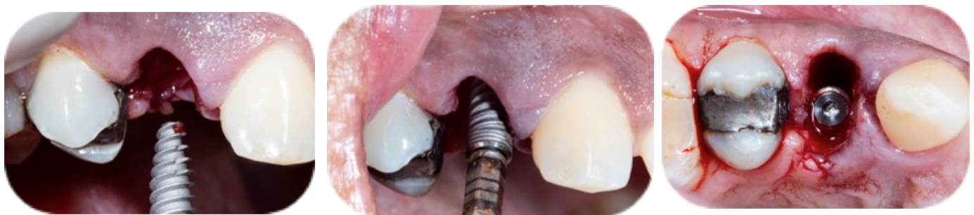
Figure 5: , Immediate Installation of Titanium Dental Implant

As planned, it was performed after extraction, immediate installation of titanium dental implant (Titanium Fix, Taubaté, SP - Brazil), Black Fix Profile line 13mm X 3.5mm ( Figure 5 ), followed by placement of bone graft of heterogeneous origin (Lumina Porous Granulation Large - Criteria Biomaterials, São Carlos, SP - Brazil) associated with autologous graft removed ( Figure 6 ) from the palate with trephine collector cutter ( Figure 7 ) (Bullet Collector - Criteria Biomaterials, São Carlos, SP - Brazil), non-cross-linked bovine type 1 and 3 bonding membrane ( Figure 8 ) (Criteria Biomaterials, São Carlos, SP - Brazil) in association with polyethylene fluoride barrier - PTFE (Lumina PTFE - Criteria Biomaterials, São Carlos, SP - Brazil)