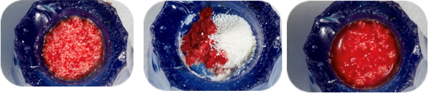
Figure 8: heterogeneous graft associated with autologous graft