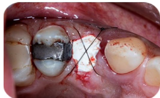
Figure 12: Sutures; (a) Palatal Simple Continuous Stitch Suture, (b) suture in point x to fix Polyethylene Fluoride Barrier