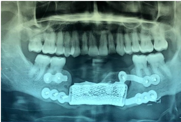
Fig.1: Patient OPT

The patient was a 62 y/o nonsmoker woman, returning from a mandibular resection of approximately 15 cm 3 due to an ameloblastoma with apposition of osteosynthesis grid (Fig. 1). The surgery needed a second phase because of the exposition of part of the implanted device caused by the ulceration of part of the ridgsoft tissues for the exiguous thickness of the mucosal area. The whole surgical procedure was carried out in an hospitalary environment (Ospedale Generale Regionale 'F. Miulli', Acquaviva delle Fonti, BA, Italy).