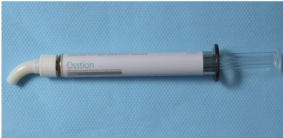
Figure 1: Primary packaging of the composite biomaterial in the form of injectable paste for bone grafting (Osstion Pasta™, Bioactive Biomaterials).

The paste interacts rapidly with the blood clot, promoting direct contact with the ceramic elements of the product. The material is gradually absorbed and integrated during the bone repair process. Over the course of weeks, the new tissue grows in the desired location. As it is an absorbable product, the need for a second surgical procedure, normally required to remove non-absorbable materials, is eliminated. The paste favours the possibility of precise application of the biomaterial in the injured area, offering excellent handling properties and biological performance. It may be used alone, or in association with autologous materials or other biomaterials. The consistency of the product provides easy adaptation and adherence to the defect and allows complete permeation of the blood. It is recommended to cover the paste with a membrane (collagen or synthetic) as a mechanical barrier (Figure 2). Likewise, it is necessary that the soft tissue flap completely covers the membrane avoiding tension, cracking, or ischemia of the mucoperiosteal flap 8 .