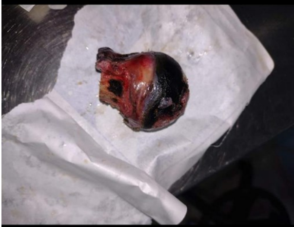
Figure 5: Excised left femoral head, note the black discoloration.