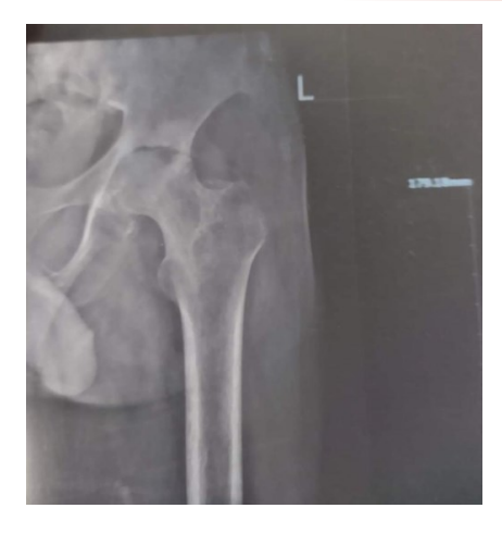
Figure 1: X-ray of the left hip, showing OA hip.