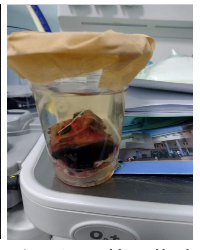
Figure 6: Excised femoral head in formalin.