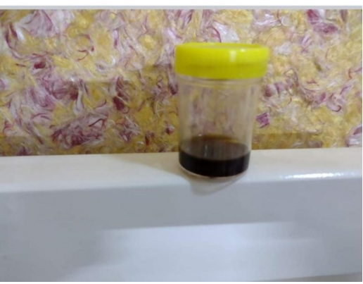
Figure 8: Urine colour turned black after 24 hours.