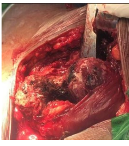
Figure 2: Black pigmentation over the greater trochanter and part of the articular surface of the hip.