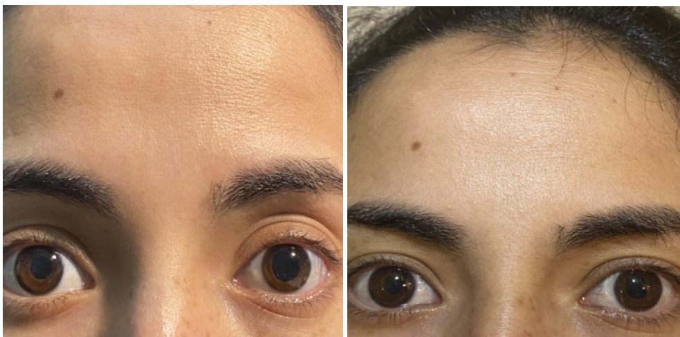
Fig 3: Pilocarpine test in left pupil. Pre and Post application.