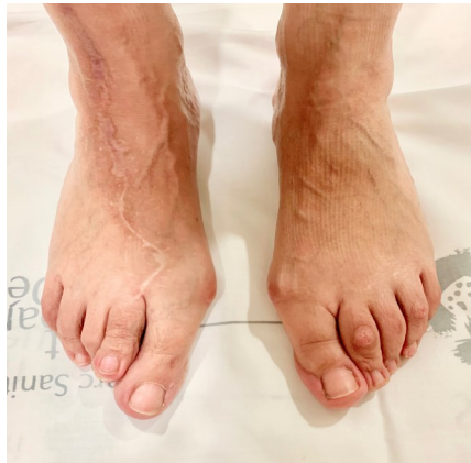
Figure 4: Clinical pictures showing the final cosmetic result at the donor site.