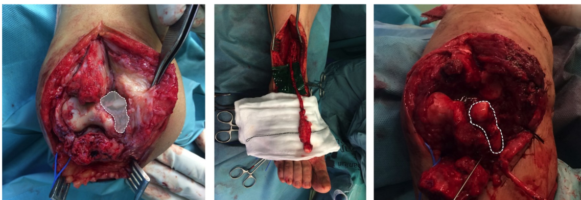
Figure 2: Intraoperative images showing the bone defect, the vascularized flap, and the finale aspect of the vascularized osteochondral flap osteosynthesis.

The patient initiated anti-reabsorptive treatment after developing osteoporosis (femoral head -2,15 and lumbar column -3.31), after three months post-operatively.